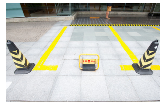
Private parking management