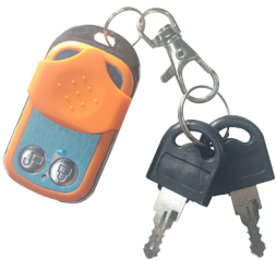
Remote control and keys