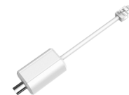
LR1002 ePoE Over Coax Converter